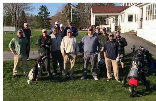
Saturday Morning Group getting started