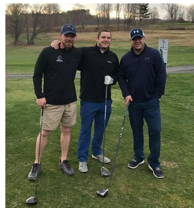
First tee time of the year

Here's to another beautiful summer at CCB!