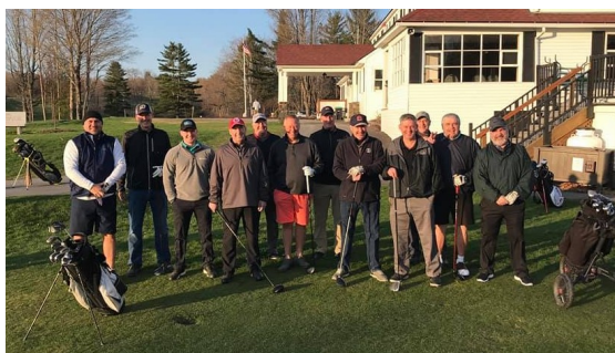
The Dewsweepers getting the day started on April 24th!