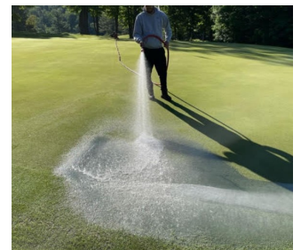
Hydraulic spill on the 11th green. Our new electric roller will eliminate this possibility