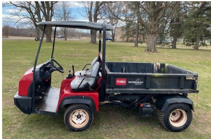
New Workman utility cart

Updates will be provided throughout the project as we finally say goodbye and so long to the old 18th green! Fundraising efforts have been strong and will continue for the rest of the year. Thanks to everyone who has donated already, And thanks to everyone who has yet to donate but hasn't quite gotten around to it yet!